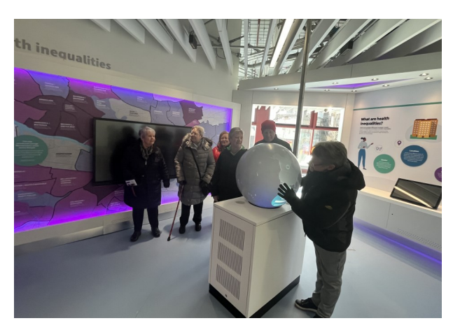
Image: Testing out the exhibits in preparation for the Feel Good Future Community Day

By Yvonne Cunningham, ReDIRECT research associate